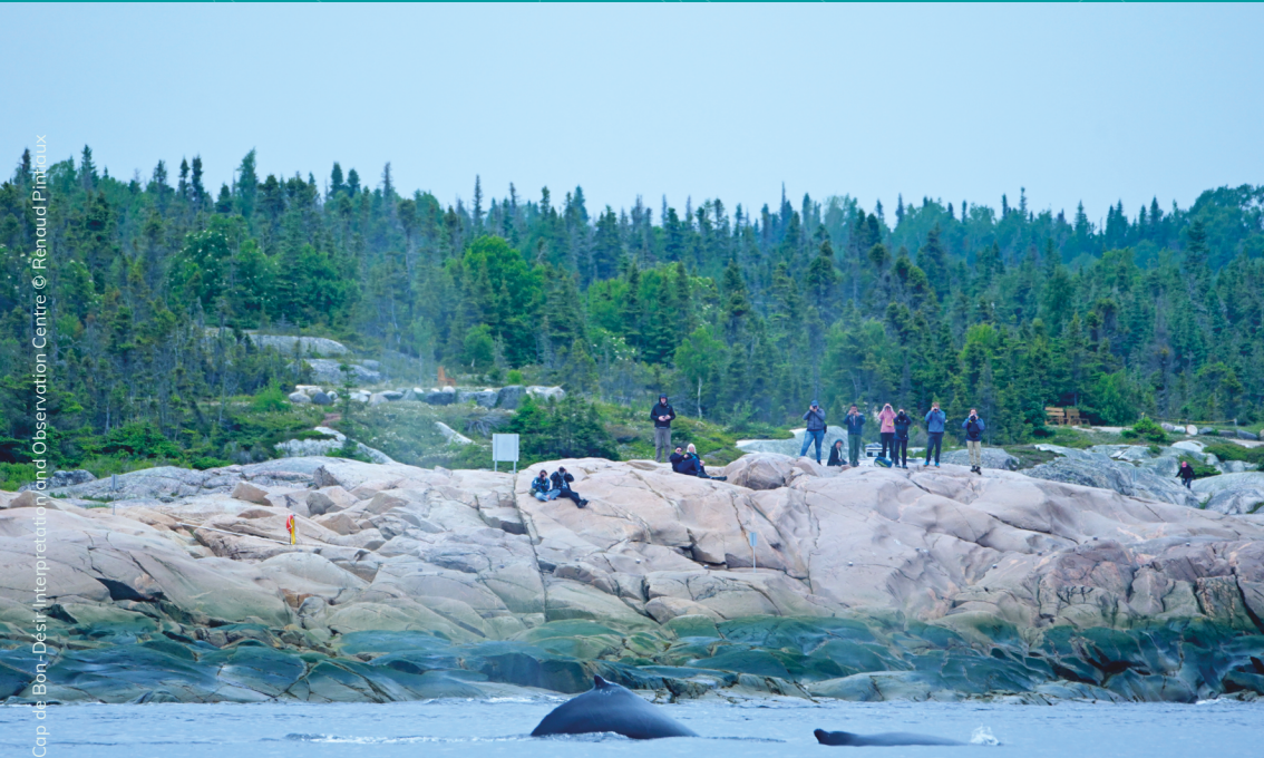
Cap de Bon-Désir Interpretation and Observation Centre

Take the time to observe whales and seals from shore or on board a ferry. This is a great way to enjoy an unforgettable experience while at the same time doing your part to respect the animals' needs for peace and quiet.