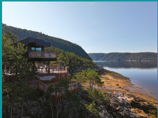
Halte du béluga in Baie Sainte-Marguerite

There are also interpretation centres and observatories that offer guided activities to learn more about the different marine species and their habitats.