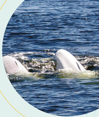
St. Lawrence belugas