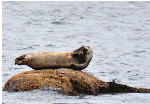
Harbour seals