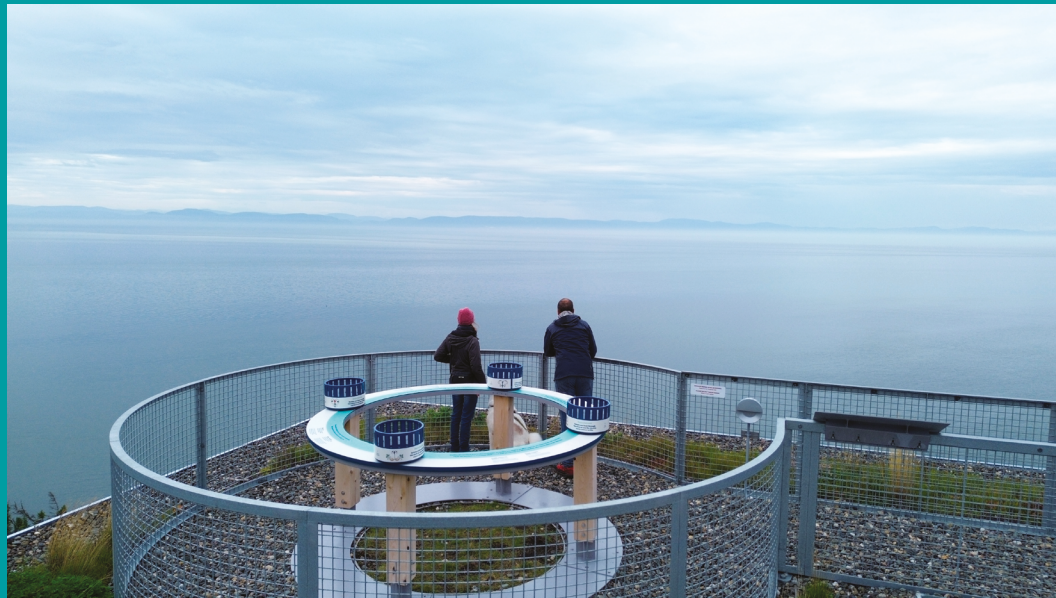
Putep 't-awt observatory of the Wolastoqiyik Wampanoag First Nation

There are also interpretation centres and observatories that offer guided activities to learn more about the different marine species and their habitats.