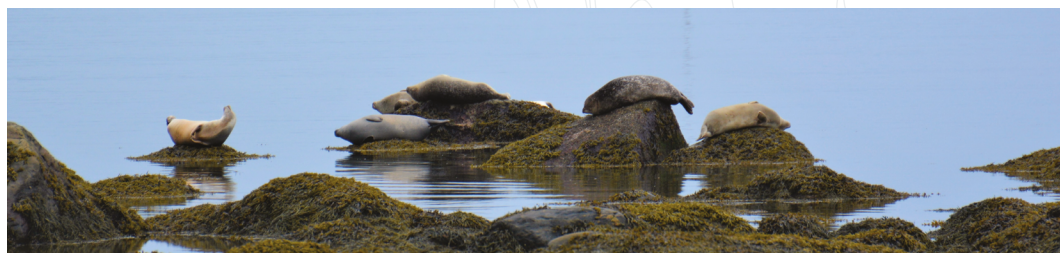
Observation of harbour seals in Bic National Park